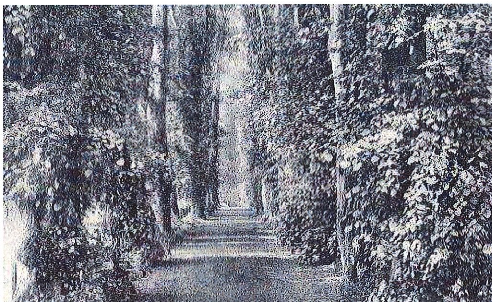
Lady Cockayne's Walk a plate from the 1873 edition of the Cockayne Memoranda by A E Cockayne

The success of the new Pavilion has added more weight to the need for the new path and will help to provide a better access to the facilities and events now available in the Pavilion.